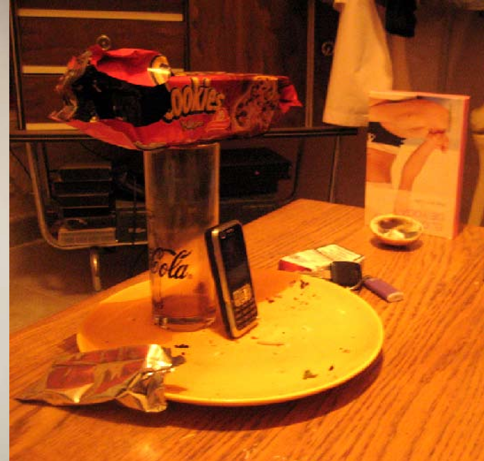
Stand on a Cocacola empty column - homework