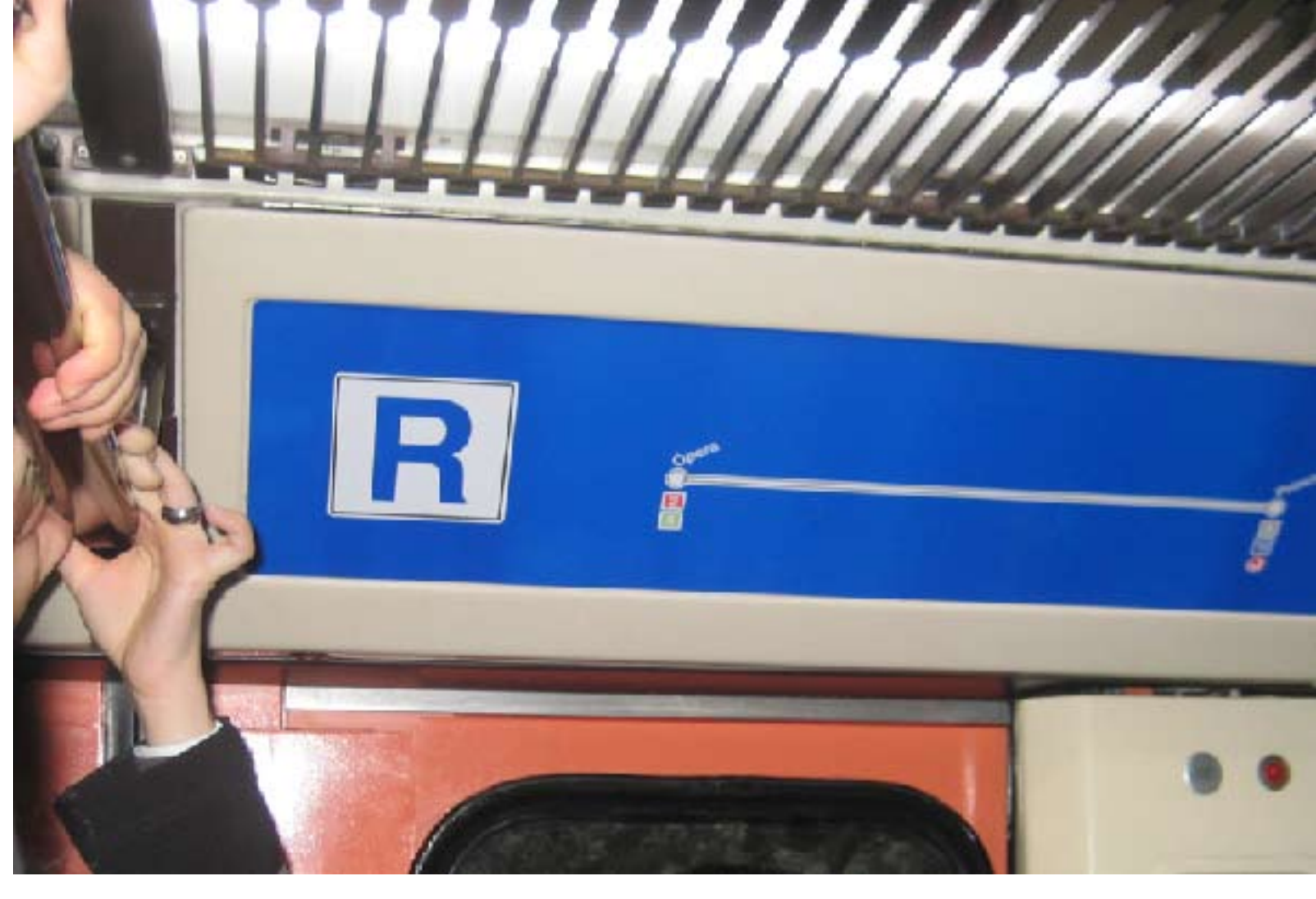
REBUS: we R between 2 points